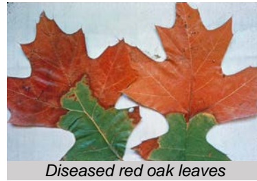
Diseased red oak leaves