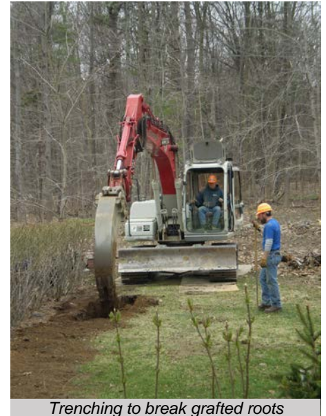
Trenching to break grafted roots