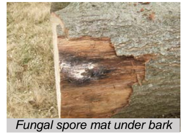
Fungal spore mat under bark